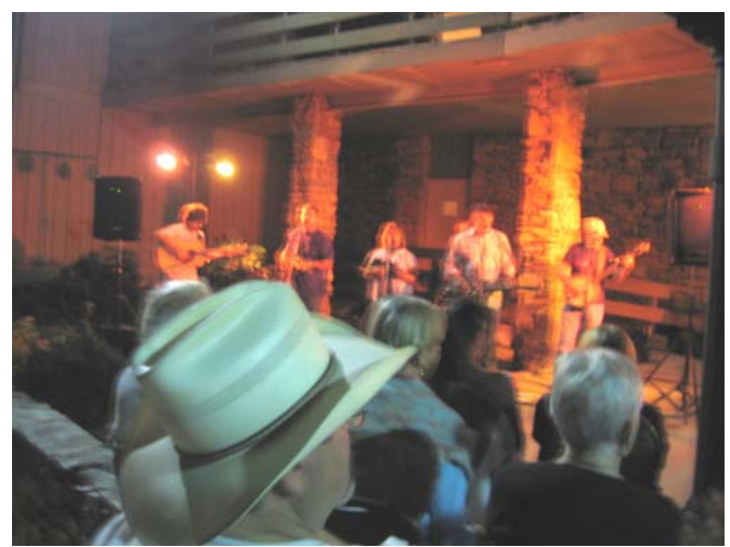
The Grass Stains perform poolside on Friday evening.