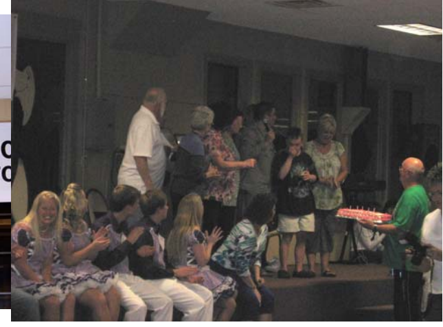
Celebrating birthdays and a 50th wedding anniversary—the couple honeymooned at Fontana!