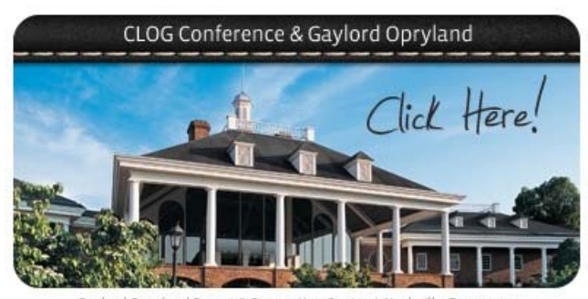
Gaylord Opryland Resort & Convention Center | Nashville, Tenneseee

<u>Video of the progress!</u> Check it out! (or go to www.clog.org and click on Convention)