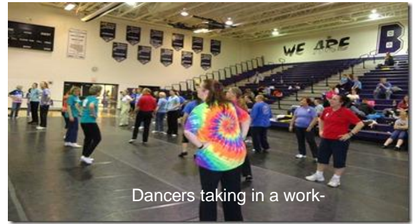
Dancers taking in a work-