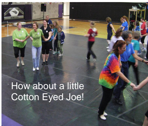
How about a little Cotton Eyed Joe!