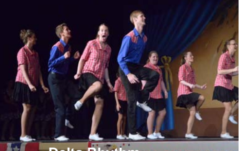
Delta Rhythmisa NATTONA