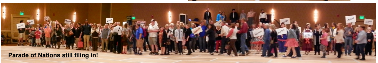
Parade of Nations still filing in!