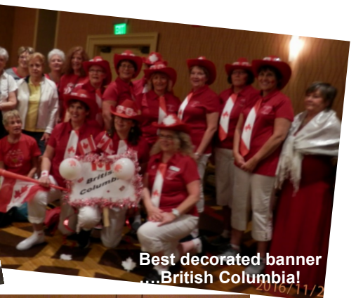
Best decorated banner ...British Columbia!