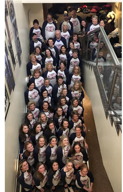
Happy New Year from all of us to all of you.....from London!