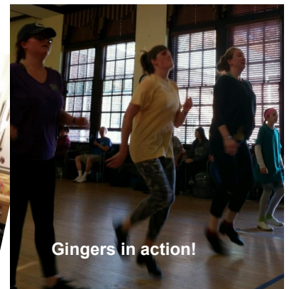
Gingers in action!