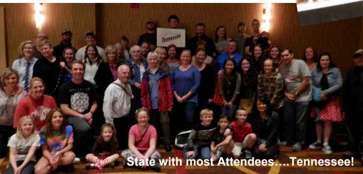
State with most Attendees....Tennessee!