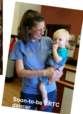
Soon-to-be BRTC dancer